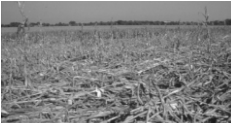
Figure 1. A cornfield in Daviess County, Kentucky, in August of 2000. This field was about 95% lodged due to stalk rot.

The mold fungus Colletotrichum graminicola causes anthracnose, one of the most economically damaging corn diseases worldwide. Anthracnose can occur either as a stalk rot (ASR), or a leaf blight (ALB) (4; 27). The leaf blight phase is generally insignificant in North America as a cause of yield loss, although in the tropics and subtropics it is much more important. Resistance to ASR is usually not correlated with resistance to ALB, complicating efforts to breed resistant corn varieties (2; 4). Resistance to ASR and ALB is mostly quantitative, although sources of major gene resistance have been described (10; 29). Hybrids containing some of these major-gene resistance sources are likely to become available for management of ASR in the near future.