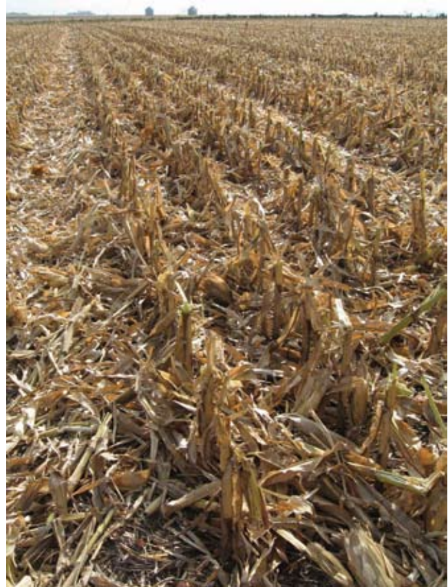
Residue is not the primary cause of yield penalties in corn following corn but may be a contributing factor among many. (Lori Abendroth)

Research conducted in a laboratory at Iowa State University showed that corn seeds placed into corn residue taken out of the field limited seedling dry root and shoot weight. Yet, when the residue was decomposed (as occurs prior to spring) the phytotoxins were inactivated by microbial breakdown, thereby not affecting plant growth. In another laboratory study by Ohio State University, corn seeds incubated in corn residue extracts had a 60 percent reduction in germination compared to the control, whereas seed incubated in soybean residue extracts had a 40 percent reduction in germination. Coleoptile (shoot), radicle (primary root), and secondary root lengths were all reduced more by corn residue than soybean residue.